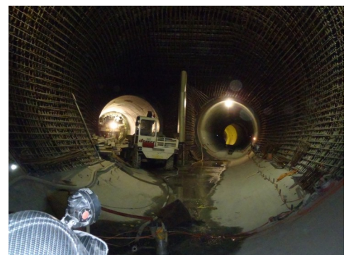
Fig 2: Pressure runnel under construction