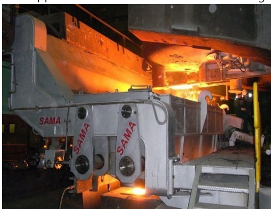
Fig 1: Steel moulding

This application controls and monitors filling and pouring of molten steel and iron in foundries. Dimetix Laser Distance Sensors are in operation to measure levels of steel and iron in order to avoid overflow.