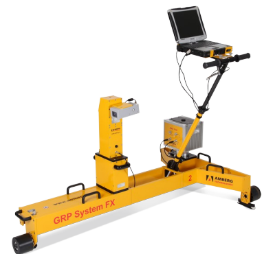
Fig 2: Amberg system GRP 3000