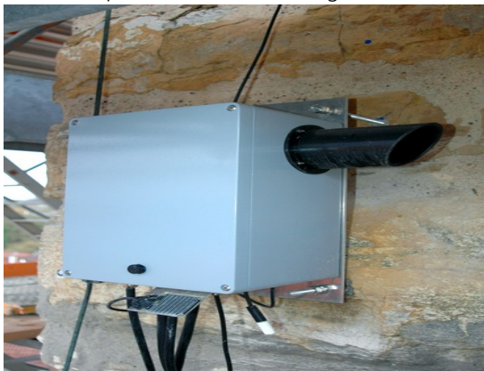
Fig 1: Dimetix Laser Sensor installed at the historical building “Blauer Turm” in Germany

Geodetic permanent monitoring of historic buildings is designed to support redevelopment concepts. Historical buildings, including church buildings, are part of a nation’s cultural and social property, therefore, conservation is not only in the interests of the owners, but also in the public interest through the ordinance on the protection of monuments.